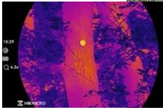
Thermal image of a GSW nest in Somerset when the adult was incubating. The nest hole and chamber are clearly visible as the orange colour Ewan Flynn is standing under the nest.

South West Optics in Torquay generously loaned Gus Robin two high end thermal imagers to see if they could be used to locate woodpecker and other nests from their thermal signal. The answer was a resounding 'yes' with good thermal signals from the known LSW nests and many new nests of Green and Great Spotted woodpeckers located from 'cold'. The technique looks so potentially useful that we have already purchased an imager for next year – a Hicmicro Falcon FQ35 for those who know about these things.