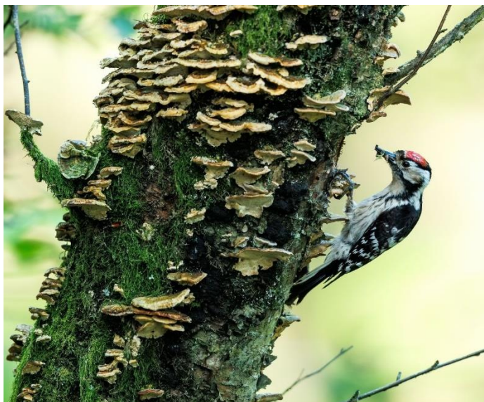
Adult male LSW at the Somerset nest

Why was 2024 so poor? Analysing our ten years' worth of LSW data it seems the birds were hit with a double whammy – April and May of 2024 were both warm and wet. In particular, the warm April meant that the defoliating caterpillars, that the birds depend on for part of the chick rearing period, would have peaked long before the LSWs were feeding their young. It also seems that the numbers of defoliating caterpillars in 2024 were low anyway. The very wet May added further problems for the birds finding food for their chicks leading to brood reduction or nest failures. It is interesting that the RSPB studies between 2005 and 2009 found a negative impact on breeding success of wet weather in May.