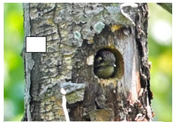
LSW Chick looking out of Norfolk nest K Bilverstone