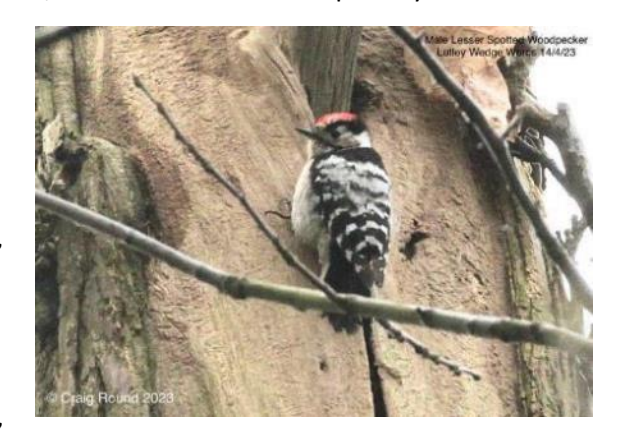
Male LSW in Worcestershire in April

Thanks also to all the observers who sent photographs