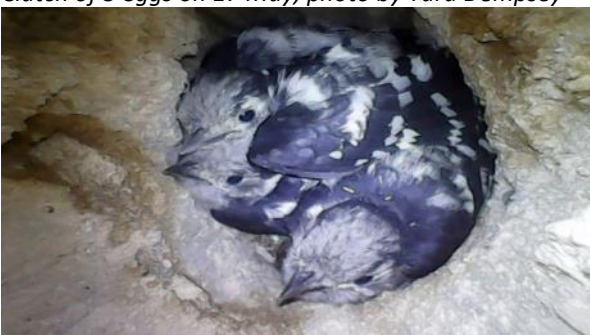
Three female chicks (note no red on their heads) in a nest in a dead Alder on 6th June, they fledged on 10<sup>th</sup>

Plans for 2024 – find and watch more LSW nests Start looking in February, Lesser Spots are active, calling and drumming, and you can see them before the leaves come out. Find LSW excavating in April. Find them feeding at the nest mid-May to mid-June. Don't give up – keep looking.