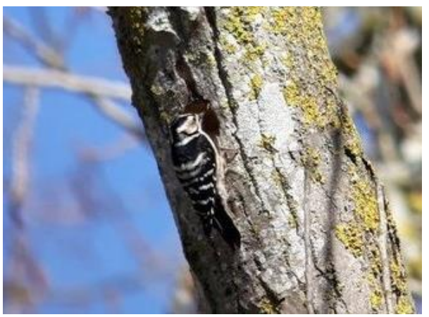
LSW female excavating at site E