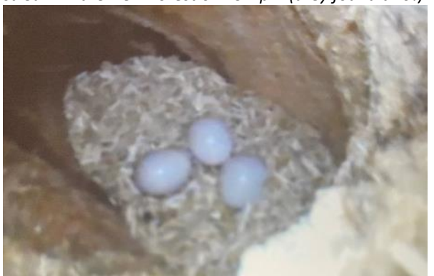
Clutch of 3 eggs on 17 May