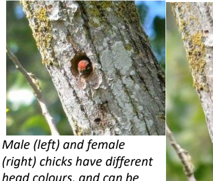
(right) chicks have different head colours, and can be distinguished in the nest, photos Nick Moran