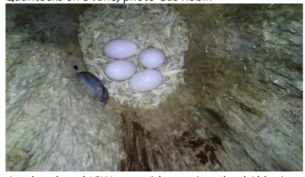
An abandoned LSW nest with eggs in a dead Alder in the Quantocks plus a slug.