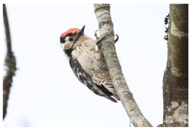
Male LSW on territory in April in the New Forest