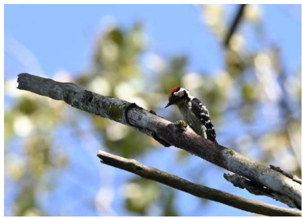
LSW near its nest in Norfolk

Site G was visited regularly by Mat Shore, KB and JP. On 5<sup>th</sup> February a male was calling and drumming. On 7 April simultaneous drumming was heard from different parts of the site and later a male and female were seen together. The male had started an excavation (A) and the birds were seen copulating. There was no further work on the cavity until 16<sup>th</sup> when the pair were seen and the male was excavating at hole A again. Over several visits the LSW were elusive and no further activity was found. The weather in April was cold and wet and seemed to inhibit progress with nest cavity excavation. Then on 7 May, Mat Shore found a fresh LSW sized hole (B) in a different area of the site. Returning very early (5:00am) the next day, Mat watched the adults changing over, confirming the birds were incubating eggs. The team monitored the nest carefully.