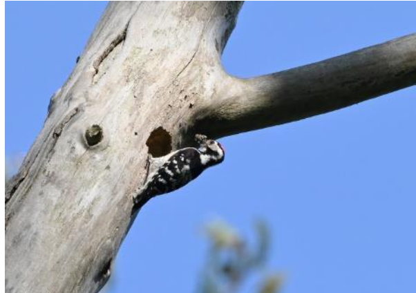
Male bringing food to the nest in a dead Poplar branch at Site G, photo Keith Bilverstone.