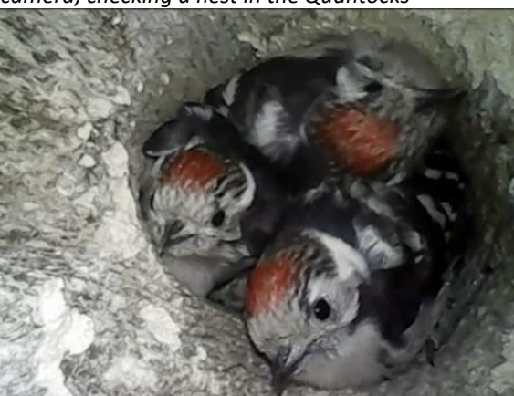
Lesser Spots chicks (3 males) in the nest cavity in the Quantocks on 3 June, photo Gus Robin