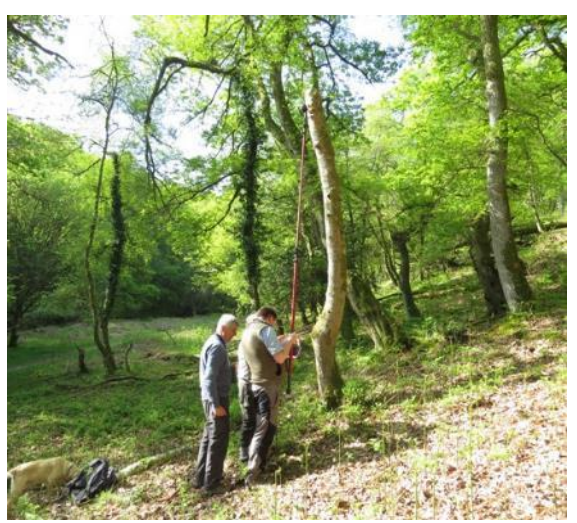
Gus Robin with the LesserSpotNet nest inspection camera, checking a nest in the Quantocks