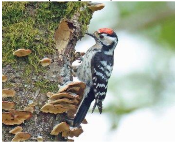
Adult male at the nest in a dead birch in Devon. Photo by Bill Coulson on 16 May